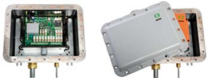
>>> TM 70 EX Receiver